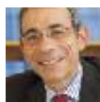
Eric P. Winer Breast Oncology Center, Dana-Farber Cancer Institute, Boston, US