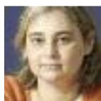
Fatima Cardoso Breast Cancer Unit, Champalimaud Cancer Center, Lisbon, PT