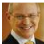
Larry Norton Breast Cancer Programs, Memorial Sloan-Kettering Cancer Centre, New York, US