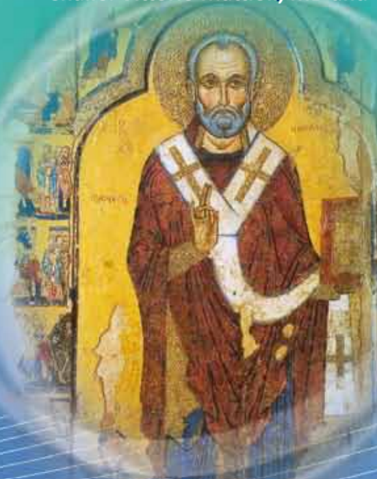
Old Icon of St. Nicholas of Bari