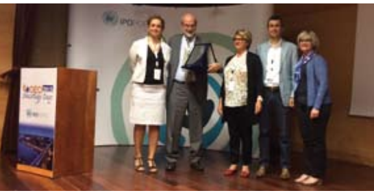
Certificate delivery to Istituto Oncologico Veneto IRCCS - IOV - Italia