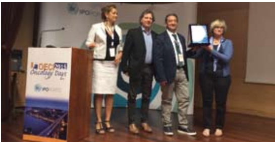
Certificate delivery to IRCCS Centro di Riferimento Oncologico della Basilicata (CROB) - Italia