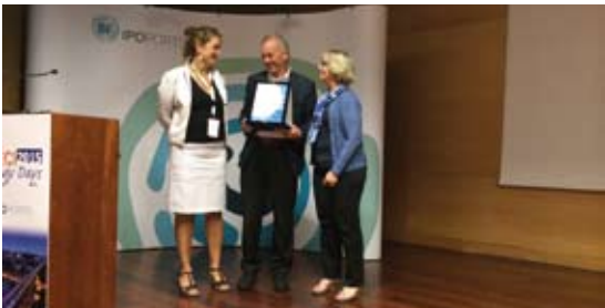
Certificate delivery to Centro di Riferimento Oncologico Aviano - Italia