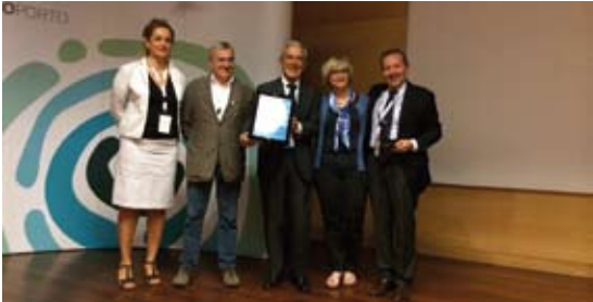
Certificate delivery to IRCCS Azienda Ospedaliera Universitaria San Martino – IST – Istituto Nazionale per la Ricerca sul Cancro - Italia