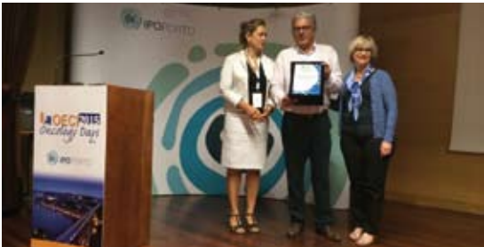
Certificate delivery to Azienda Ospedaliera – Arcispedale Santa Maria Nuova IRCCS Reggio Emilia - Italia