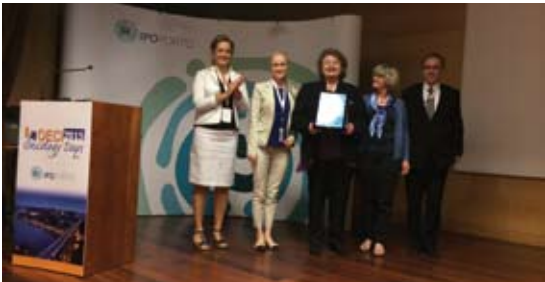
Certificate delivery to Tartu University Hospital Estonia

During the 2015 General Assembly, 9 Cancer Centres have been certified and the Delegates of eight of them received the certificate on plate from the OECI President and the OECI A&D Chairperson.