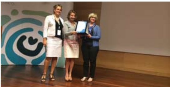
Certificate delivery to Fondazione IRCCS Istituto Nazionale dei Tumori Milano - Italia