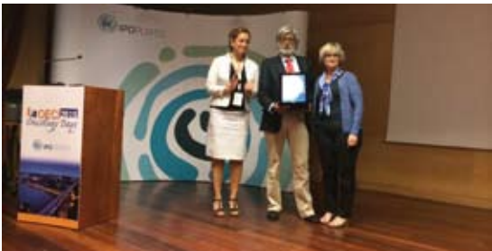
Certificate delivery to Istituto Tumori Giovanni Paolo II, IRCCS Bari - Italia