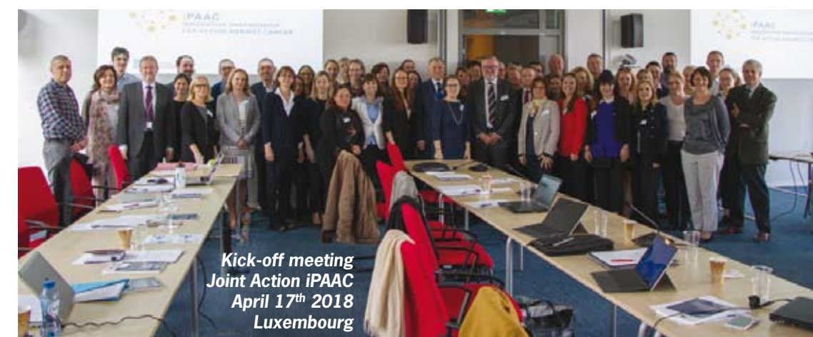
Kick-off meeting Joint Action iPAAC April 17 th 2018 Luxembourg

The iPAAC Joint Action has officially started on 1 st April 2018 and it will last for three years. It includes 40 partners from 24 European countries and will be coordinated by the National Institute of Public Health Slovenia (NIJZ). More information about the iPAAC Joint Action can be obtained by visiting the official website ( www.ipaac.eu ) or by contacting the coordination team ( ipaac@nijz.si ).