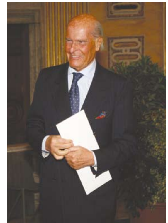
Prof. Umberto Veronesi at First Edition of the OEI Oncology Days Genoa, 2008

With the death of Umberto Veronesi the world has lost a true visionary. He will be sorely missed by everyone who had the privilege to know and work with him, and millions of cancer patients around the world will continue to benefit from his life's work for many years to come.